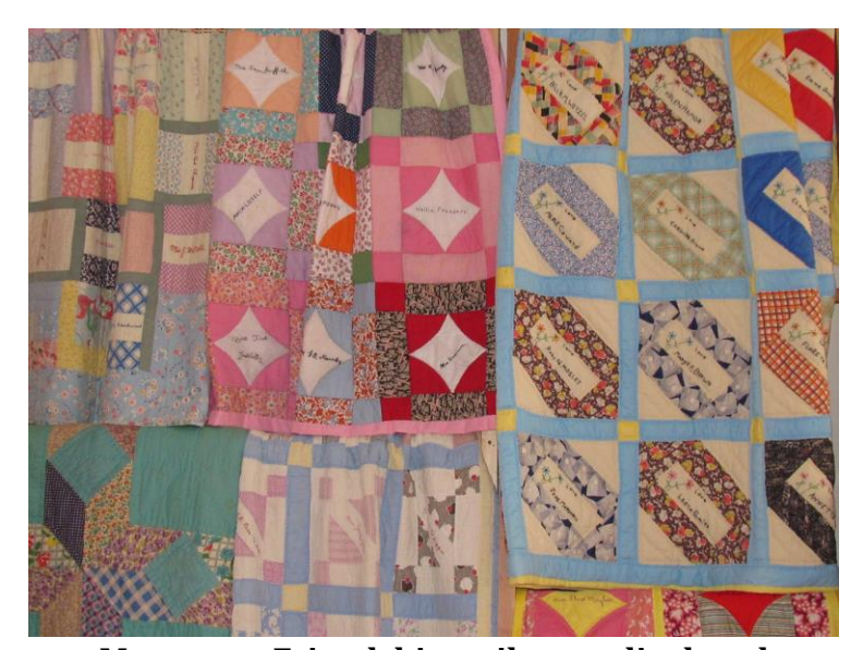
Many area Friendship quilts are displayed

The halls and foyer are decorated with early Winters town scenes and early members of the community. The upstairs rooms are dedicated to special displays. There is the Bridal Suite with its private bathroom, the veterans room, the "Lazy N Stable", a miniature horse establishment, an extensive display for native son, Rogers Hornsby, and, of course, a quilt room.