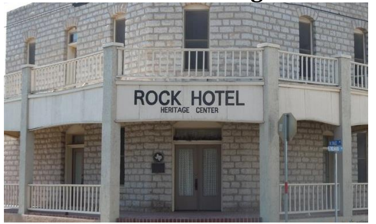
Rock Hotel constructed of local stone in 1909

Construction was completed at the same time as the Abilene & Southern Railroad started service. With the arrival of rail service to Winters the hotel was available to accommodate both inbound and out going passengers. Being just one block from the train depot it was handy for both passengers and traveling salesmen (see Drummer House).